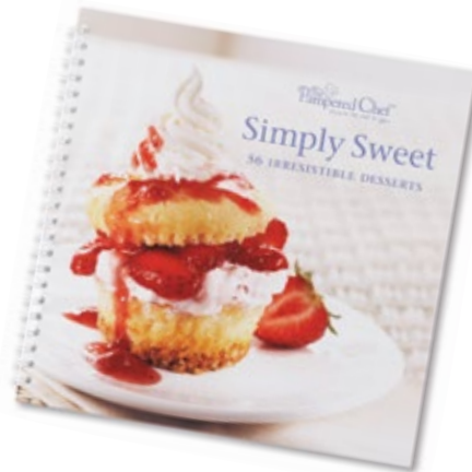
Simply Sweet Cookbook $15.50 value